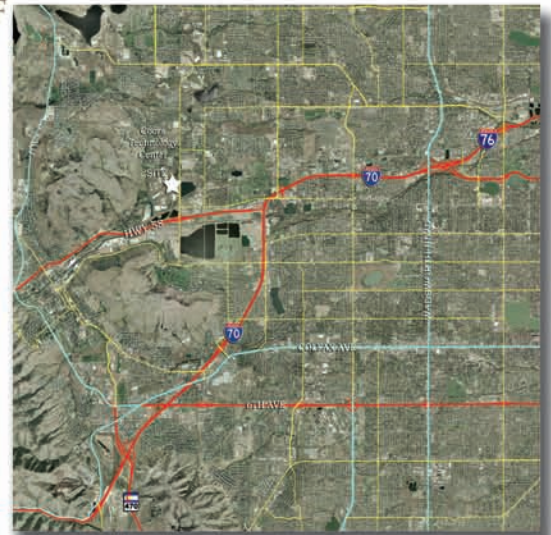
FIVE MINUTES WEST FROM I-70 & HWY 58 FLYOVER